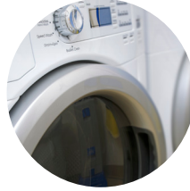
ENERGY STAR® appliances