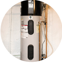
Heat pump water heaters