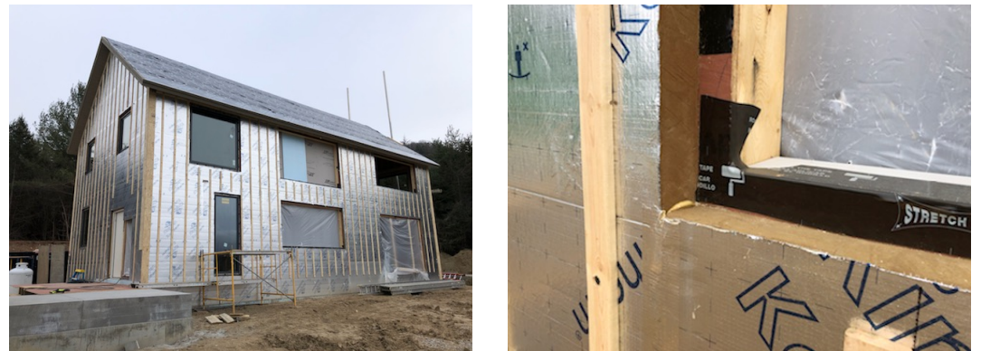
Figure 4. exterior insulation with strapping (left), phenolic foam detail at window opening (pre-flashing) (right).