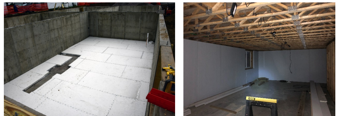
Figure 3. EPS sub-slab insulation (left), polyisocyanurate interior foundation wall insulation (right).

The project was completed in early 2021. The builder reported that the price difference on replacing XPS with Type IX EPS (under slab) was less than $100. The builder also saved labor, as the EPS came in a thickness that required a single layer—previous practice was putting down two thinner layers of XPS. For the interior foundation wall, he chose Thermax (a sheet polyisocyanurate product). By shifting this insulation to the interior, he avoided having to follow local rules on covering exposed foam board. See Figure 3 for project photos. The builder's focus was on speed and price, and these substitutions worked well for the project. Carbon savings alone would not have been sufficient motivation.